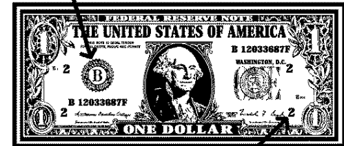
Federal Reserve District